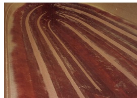
Medium weight used in Filling Strakes