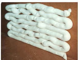
"Stays put"2 on just about any surface