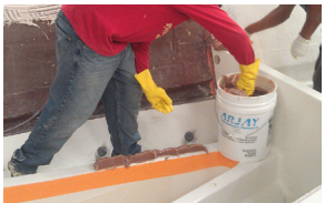
Preparing stringers for liner/deck