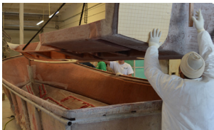
Bonding stringer assembly to prepped hull