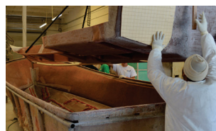
Bonding stringer assembly to prepped hull